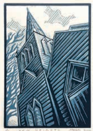
Jacquie Byars, Welcome Back / New Heights I / New Heights II , woodcuts, 210mm x 150mm (unframed)