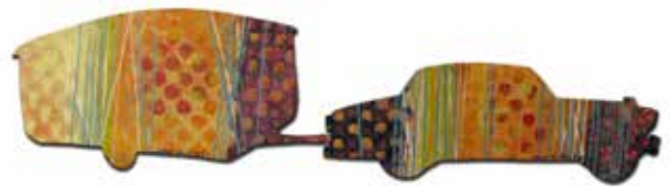
Janet de Wagt, Car & Caravan No.3 , Acrylic on board, 380mm x 790mm $360, two designs left