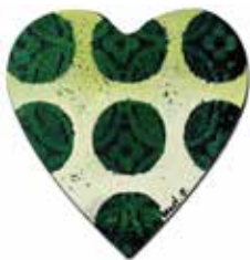
Janet de Wagt, Heart No.8 , Acrylic on board, 160mm x 160mm $80 each, more designs available