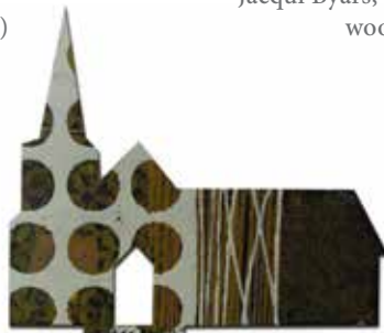
Janet de Wagt, Church No.37 , Acrylic on board, 240mm x 360mm $180 each, more designs available