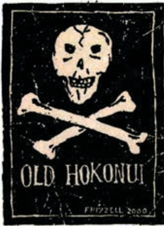
Dick Frizzell, Old Hokonui , lithograph, 360mm x 280mm (framed)

All can be viewed on our website or at the Gallery. If you are interested in purchasing any of these please contact us at artgallery@goredc.govt.nz