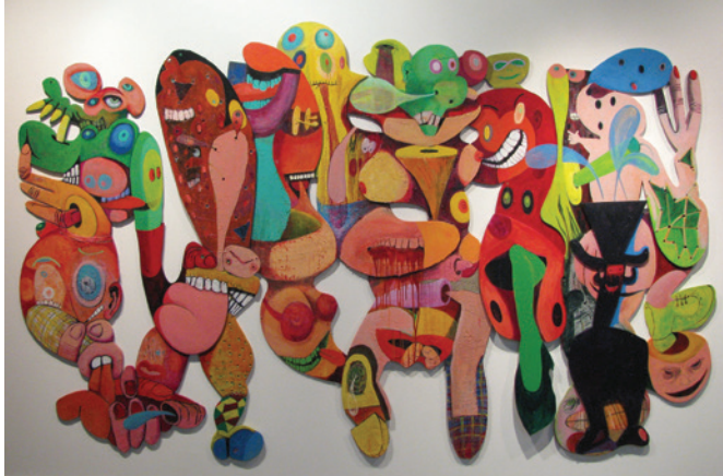
Rob McLeod, Swimming Against The Tide , 1990's and 2005, oil on plywood

I See Red brings together a vibrant selection of paintings, prints, and sculptures that explore the colour red in all its shades and intensities. Drawn from the Gallery's