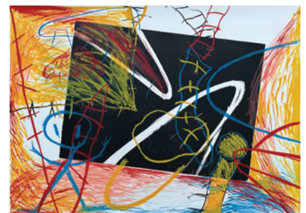
Philippa Blair, Throw A Ladder To The Sky , 1989, lithograph